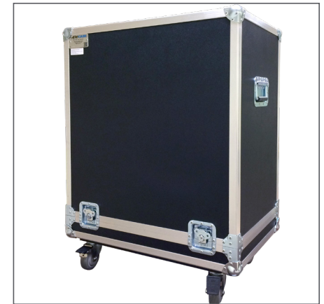
Model 2705 optional heavy duty transport case.