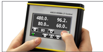
Optional SIGMA LT Hand-Held Terminal.

ASCO load banks comply with NEMA, NEC, and ANSI standards. Quality control system is certified to ISO9001 standards.