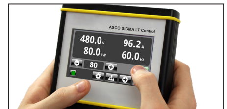
Optional SIGMA LT Hand-Held Controller.